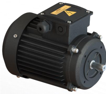
IS:12615 (Premium Efficiency)